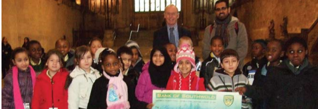
Southwold School at the House of Lords