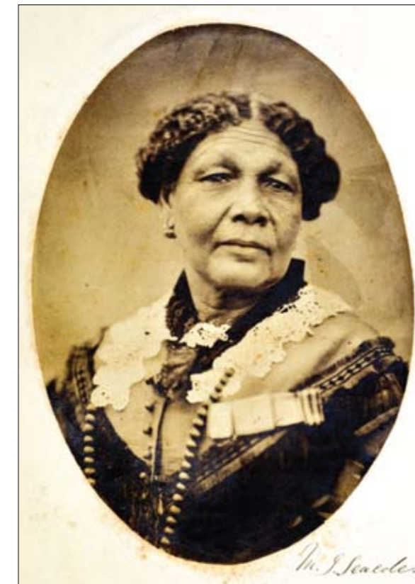
New photograph found of Mary Seacole

The Trustees gratefully acknowledge the contribution of the Appeal Patrons, Stakeholder Organisations, the individual Appeal Ambassadors, the Artist Selection Panel, and the Facilitating Committee, who contributed to the work over the year.