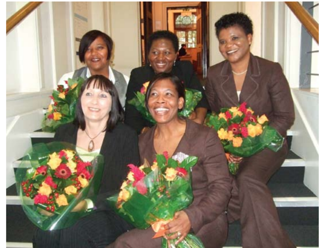
Mary Seacole Leadership In Nursing Awards - October 2009