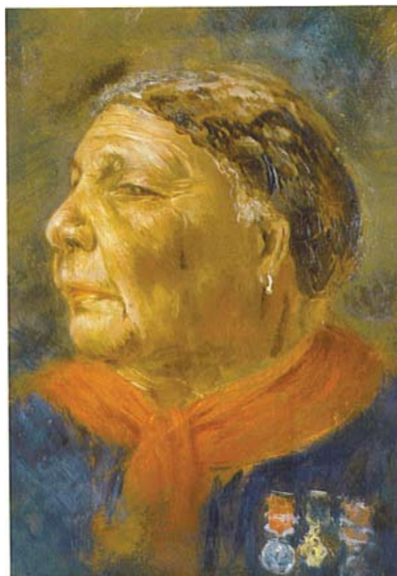
Photo and painting of Mary Seacole