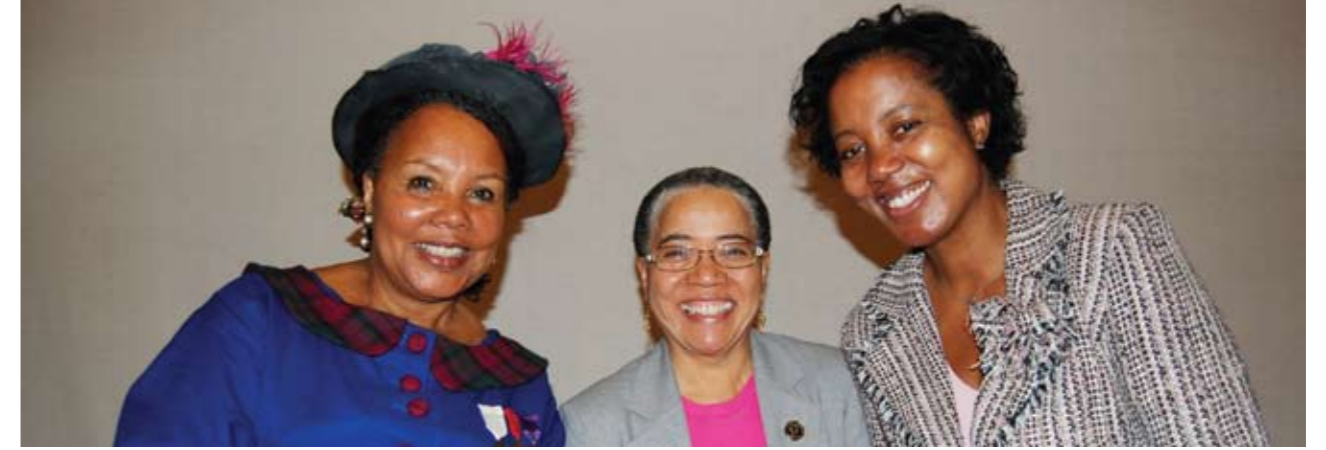
Mary Seacole Performance at Bernie Grant Arts Centre, October 2009