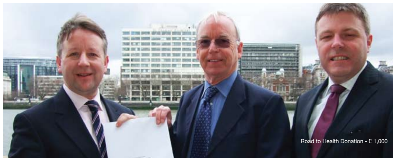
Road to Health Donation - £ 1,000