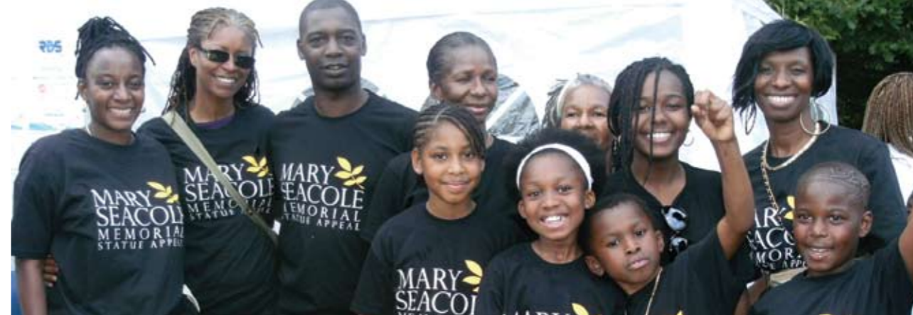
Mary Seacole Fundraising Event 2009